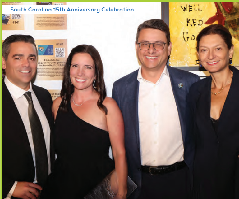
South Carolina 15th Anniversary Celebration