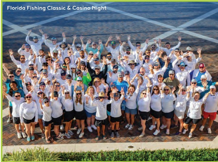
Florida Fishing Classic & Casino Night