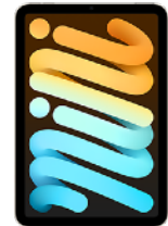
iPad Pro 11-inch (4th generation) iPad Pro 12.9-inch (6th generation)