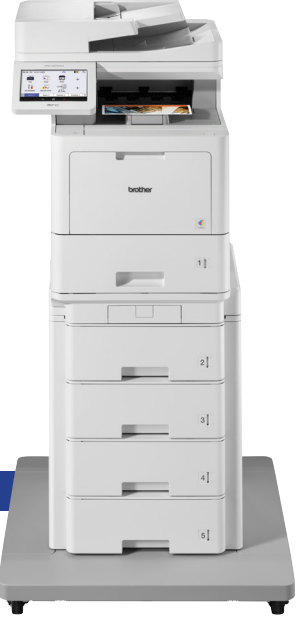
ALL-IN-ONE SHOWN WITH OPTIONAL TOWER TRAY AND CONNECTOR