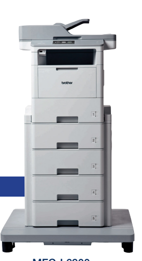
MFC-L6900<sub>DW</sub> PLUS TOWER TRAY OPTION