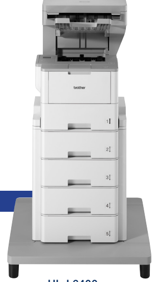
HL-L6400<sub>DW</sub> PLUS TOWER TRAY AND STAPLER FINISHER OPTIONS

> Second 520-sheet capacity paper tray<sup>2</sup>