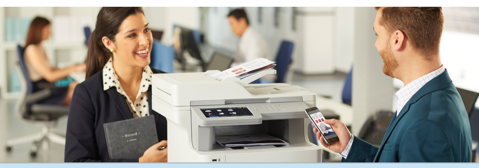
PLUS TOWER TRAY WITH CONNECTOR OPTIONS