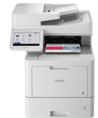
MFC-L9630CDN / MFC-L9670CDN