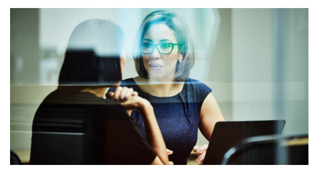
Harel Group simplifies its cloud journey with Commyault Cloud