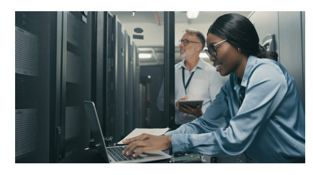
Evolutio ensures data readiness and reduces costs with Commvault Cloud